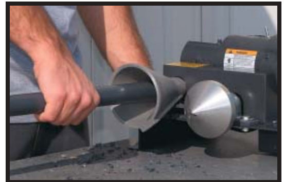
Gently pushing pipe into O.D. beveling cone will quickly produce the proper bevel.