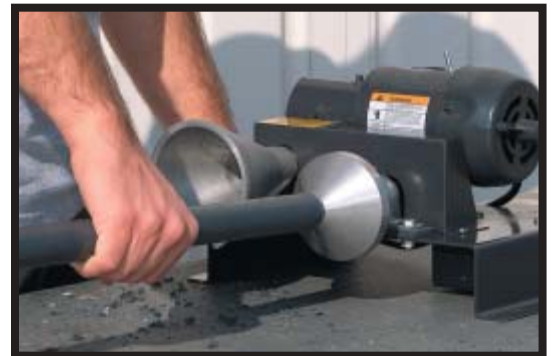
I.D. beveling cone removes sharp edges from the inside pipe diameter for smoother fluid flow.